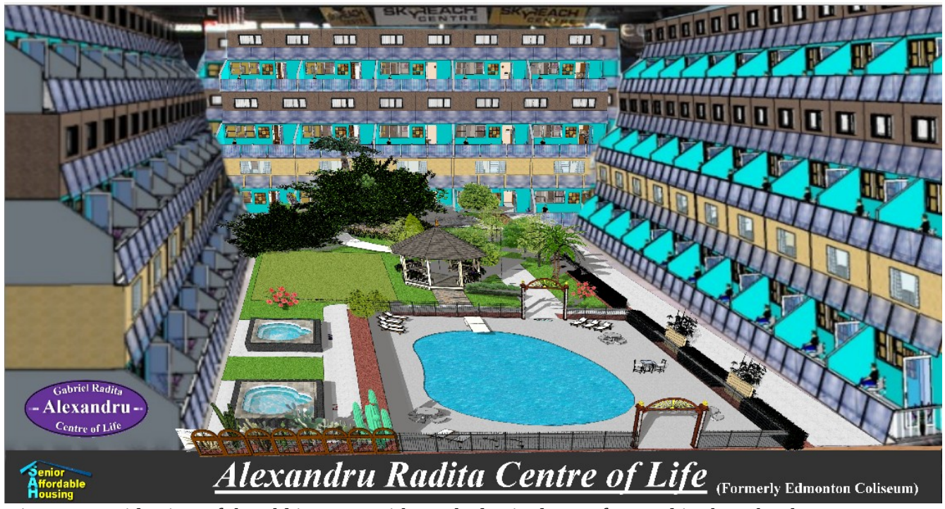
Figure 2: Inside view of the old ice area with stacked suited manufactured in the school

Lets face it, technology can be the enemy of labor force if we don't take into account that replacing 5 people's jobs with machinery, what will those 5 people now do? Difficult question!! This is one of the purposes of the ARC.