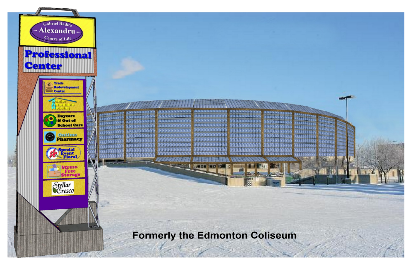
Figure 1: South view of the Edmonton Coliseum covered with solar panels

Welcome to the "Alexandru Radita Centre of Life". This is the operating name for the non-profit organization "12937212 Canada Centre" currently registered with Not-For-Profit Corporations Canada.